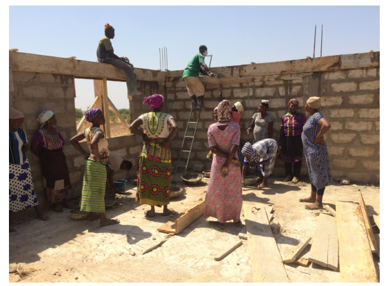
Community input into building projects