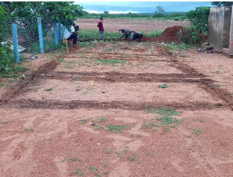
Mapping out the structure