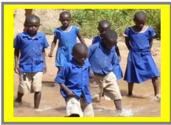
Children cross the stream to reach La'Angum Learning Center from Bantambaari

Years ago, a student's illustrated story showed how, during the rainy season, the stream between the Bantambaari community and La'Angum Learning Center became too swollen and filled with large fish to be forgeable by younger children, preventing them from attending school.* Last year, PAMBE Ghana's partner Rainbow of Hope for Children provided seed funds to build a preschool in Bantambaari so that its youngest children may begin their education. Parents are providing building assistance, and PAMBE Ghana is assisting with educational materials and support.