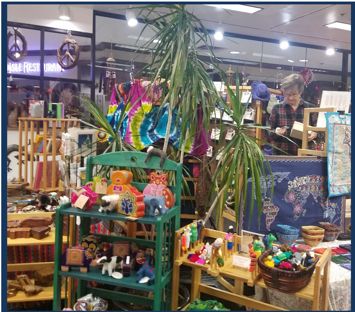
A volunteer surveys the Market's colorful handmade items

From its birth in 2009 as a small holiday fair trade market, PAMBE Ghana's Global Market has grown into a much-anticipated annual shopping event. Come browse the Market for more ways to win + win + win : purchase unique items to keep or gift + provide fair wages to the artisans + know that 100% of net proceeds go directly to support and educate children at La'Angum Learning Center. The Market will be open Tuesdays through Fridays from noon until 6:00 P.M and Saturdays 10:00 A.M. until 6:00 P.M. - through December 24th. Also, you may schedule a holiday shopping party at the Market after hours. Enjoy your celebration in a space rich with opportunities to shop for beautiful handmade Fair Trade items. We provide tables for any food and beverages you would like to serve to your guests. Best of all, it's free! To schedule, contact Sara Braden at (405) 210-5214.