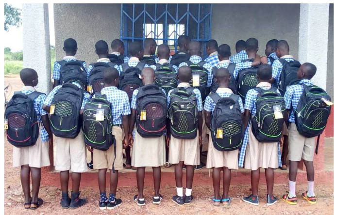
La'Angum Learning Center's 2018 sixth grade graduates are proud to show their new middle school uniforms and backpacks